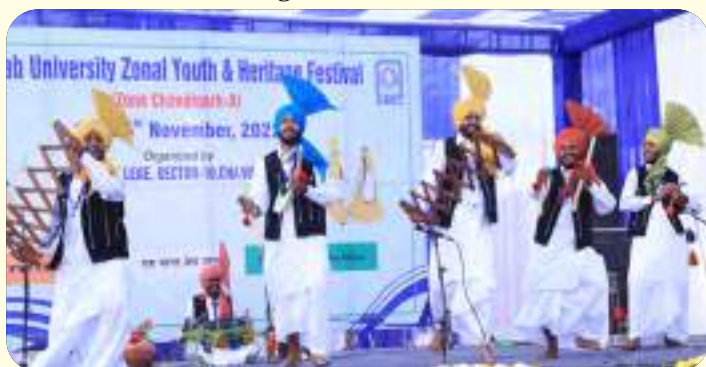
Folk Orchestra - Third in PU Zonal Youth & Heritage Festival 2022-23