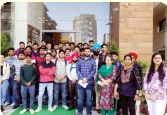
Educational Visit to CS Soft Solutions Pvt Ltd Feb 23, 2023

37 students along with 03 faculty members visited the CS Soft Solutions Pvt Limited, Mohali to gain insight regarding the internal working of the company. It helped to combine theoretical knowledge with practical knowledge.