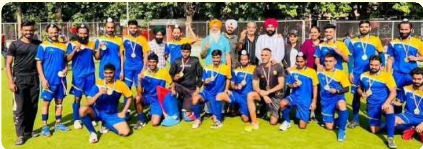
Winners of Panjab University Inter-College Hockey Championship