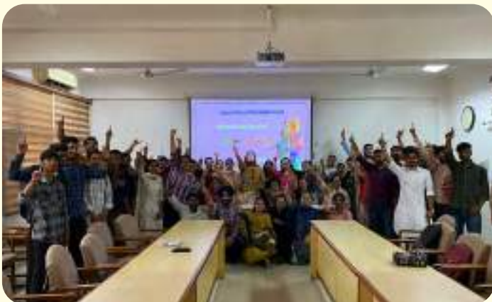
Students, Faculty and team from Sanjh Jagori participating in the 'One Billion Rising Campaign- 2023'- A Global Movement to promote Gender Equality