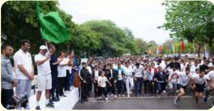
Volunteers in Marathon for LIFE- Lifestyle for Environment, by EIACP, Department of Environment, Chd Administration