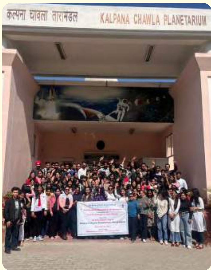
Educational Visit to Kalpana Chawla Planetarium, Kurukshetra Feb 24, 2023

Museum, which showcased the state's rich historical, cultural and architectural heritage. A total of 90 students and 05 faculty members visited the Planetarium.