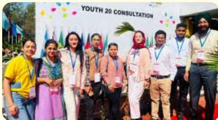
Prize Winning Students at Youth 20 Consultation Panjab University G20 Youth International Seminar