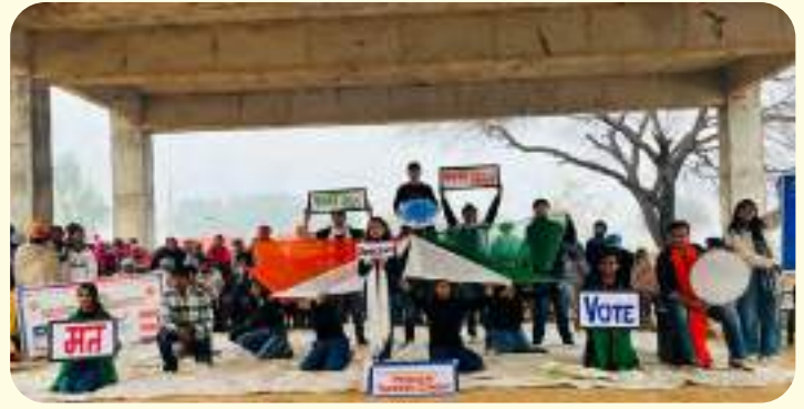
Nukkad Natak on 'Sabki Vote Sabka Vikas' performed at Tasoli village to commemorate National Voters Day