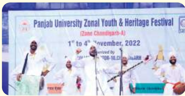
Folk Dance - Second in PU Zonal Youth & Heritage Festival 2022-23