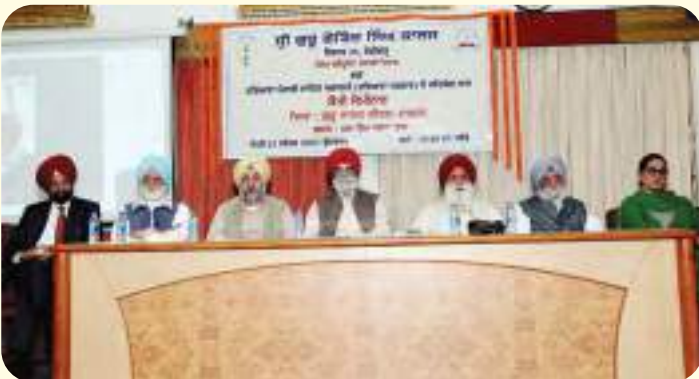
National Seminar on ‘Guru Nanak Jeevan Darshan’ Nov 23, 2022