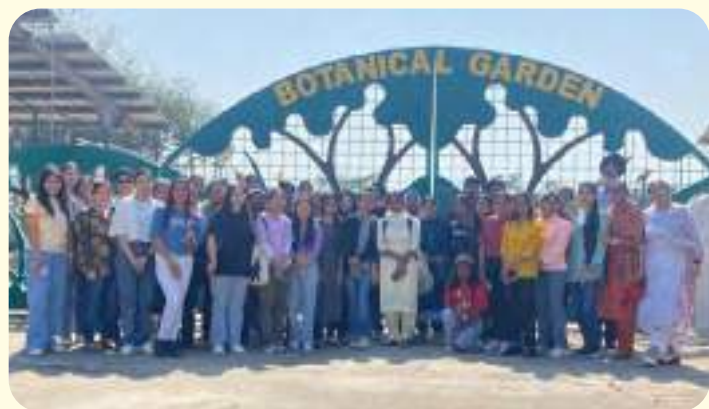
Educational visit to Botanical garden Sarangpur Mar 09, 2023

A total of 40 students accompanied by 04 faculty members visited PN Mehra Botanical Garden & Botanical Garden Sarangpur. The students were sensitised about diverse flora and fauna. The students also visited Tissue Culture Lab of Deptt of Botany, PU, Chd and learnt about various techniques of tissue culture and recent developments in the field of tissue culture.