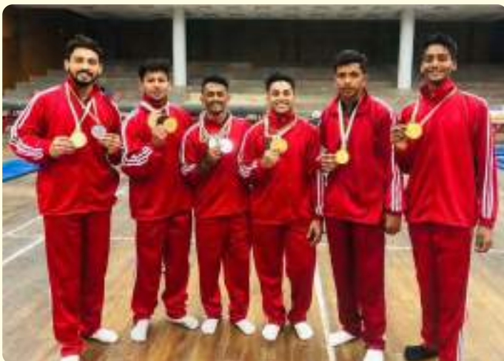
Winners of Panjab University Gymnastic Championship