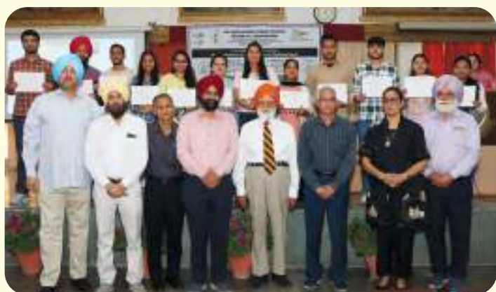
Two Day BRNS-IANCAS National Workshop on 'Radiochemistry & Applications of Radioisotopes on Mar 25-26, 2023.