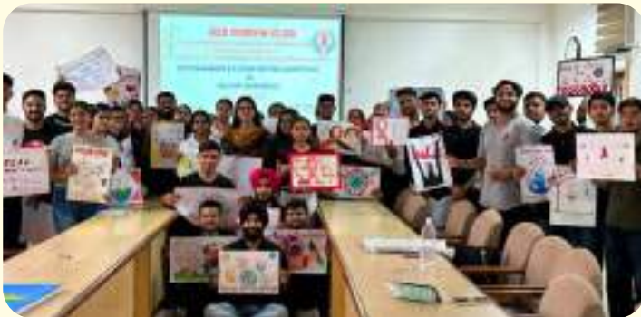
Poster Making & Slogan Writing Competition on HIV/AIDS Awareness