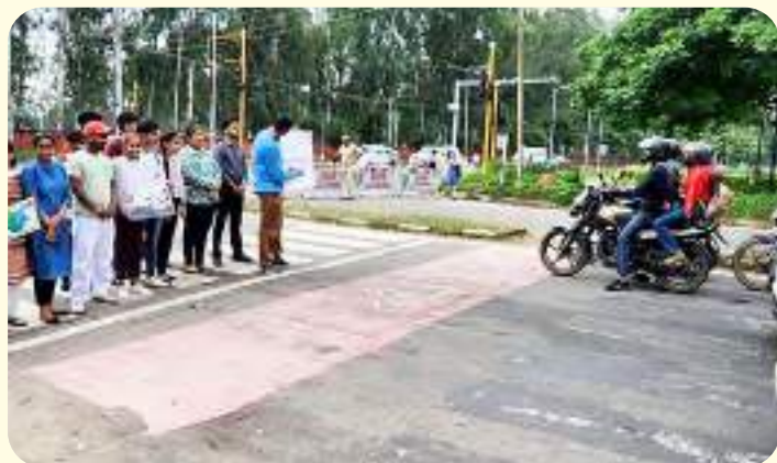
Awareness Rally by Eco Scouts to Combat Carbon Footprint to commemorate World Ozone Day

students, and the wider community, the society plays a pivotal role in cultivating a shared understanding of environmental issues and fostering a sense of collective responsibility towards safeguarding our planet. In essence, the Dharat Suhavi Environment Society's efforts serve as a catalyst for positive change, inspiring individuals and communities to embrace environmentally sustainable practices and work towards a more harmonious relationship with the natural world. Through its advocacy and outreach activities, the society demonstrates a steadfast commitment to building a sustainable future for our planet.