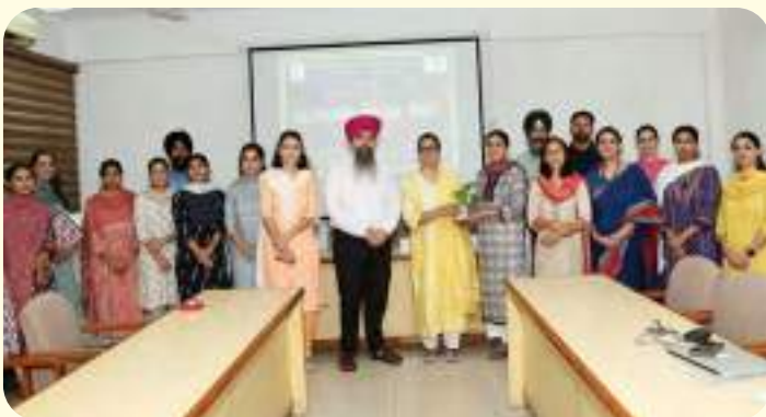
Autumn Muse-2022 Sep 02, 2022

The Literary Competition was conducted in six categories including Debate, Elocution, Poetry Recitation, Poetry Writing, Essay and Short Story Writing. The event witnessed an overwhelming participation from 94 students. The winners were awarded certificates.