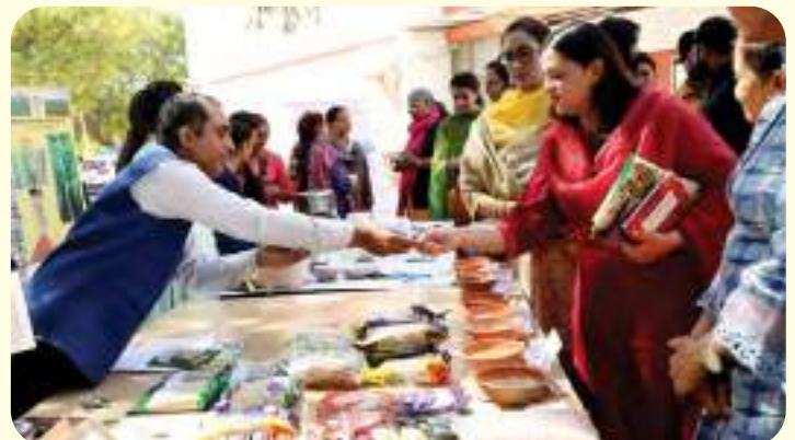
Stalls of Phulkari, Manure Mart, Jaggery Junction, Handicraft Hub & Millet Meals at Campus Bazaar to promote Entrepreneurship & support Student Self-Help Groups