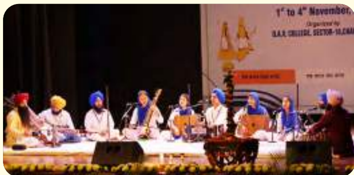
Group Shabad Team- Third in PU Zonal Youth & Heritage Festival 2022-23