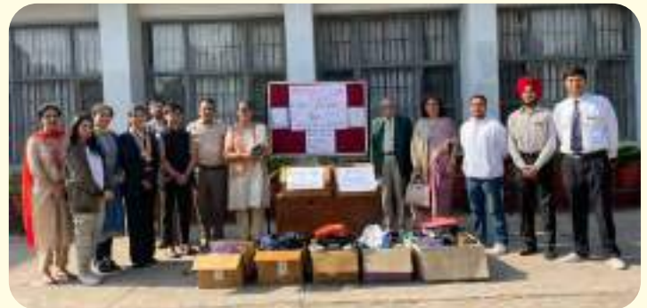
Donation Drive for needy people and adopted animals organised by SGGS Rotaract Club