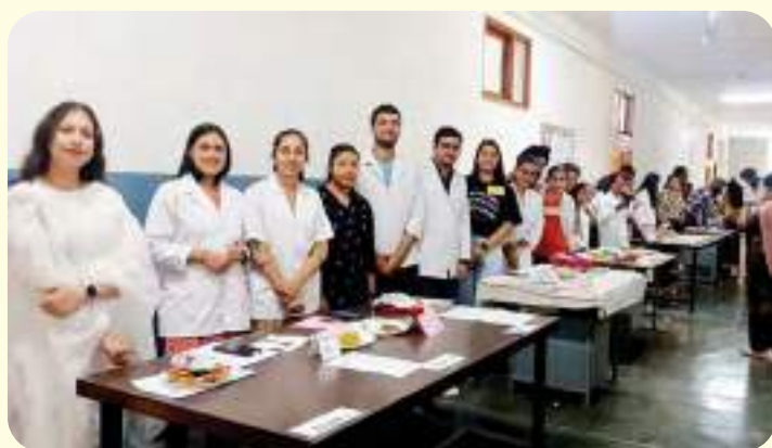
Inter-College Cooking Competition 'Chemistry Cuisine-Know Your Ingredients'