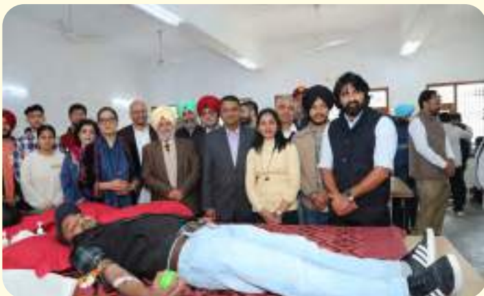
Blood Donation Camp organised during the annual Alumni Meet, Feb 10, 2023.