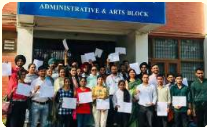
Campus Placement Drive 2022-23 by Piramal Finance Sales and Service Pvt. Ltd

The Training and Placement Cell of the College not only maintains contact with distinguished organisations and industrial enterprises, but also efficiently delineates the career counseling opportunities for students. It has been continuously