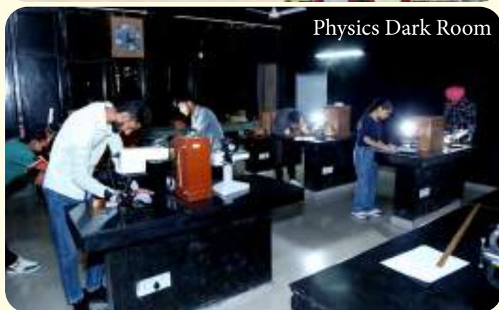
Physics Dark Room