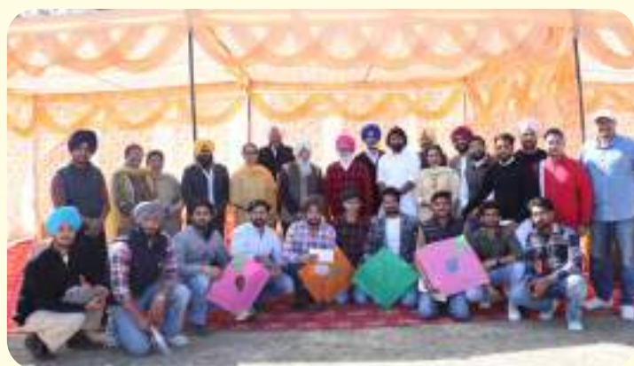
Winners of Inter-College Kite Flying Competition held to celebrate the festival of Basant Panchmi