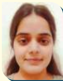
INDU MSc Physics, CSIR-UGC-NET Jun 2022