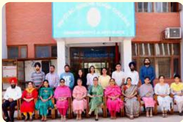
Editorial Board of Agammi Jyot with the College

The Annual College Magazine ‘Agammi Jyot’ is the reflection of the academic excellence and intellectual evolution of the students while they are enrolled in various programmes of formal education. It brings forth their creativity, self-expression and opinions. The aim is to make learning an encouraging, fulfilling and pleasing experience through a multidisciplinary approach of combining theory and practice. Every year the magazine is based on a theme that promotes the holistic development of the students. This session’s edition ‘Agammi Jyot: 2022-23’ aims to uphold the rich heritage and bring it in sync with