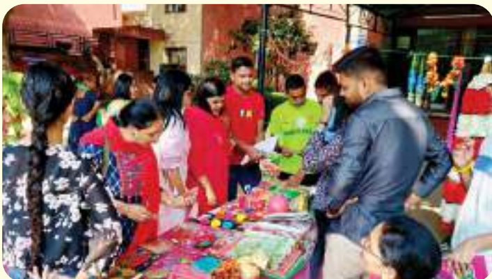
Stalls of Phulkari, Mud Diya, Candles and Festive Decor items to promote Women Entrepreneurship in collaboration with MGNCRE GOI