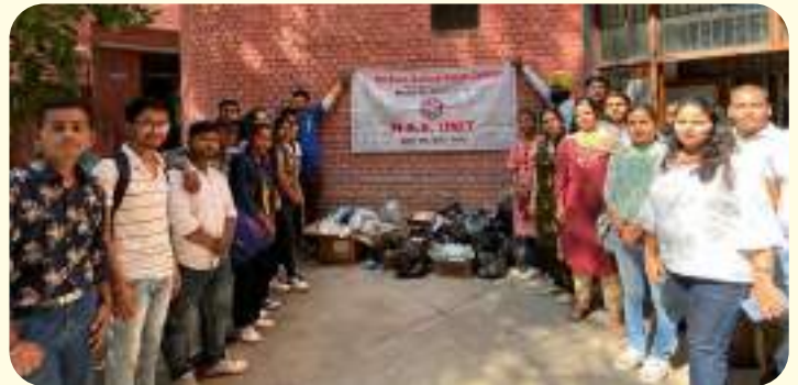
Plastic Waste Collection Drive by NSS Unit in collaboration with Municipal Corporation, Chandigarh