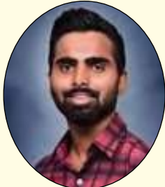
PRINCE BA III