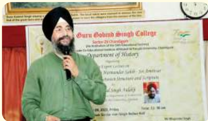
Expert Lecture on ‘The Evolution of Sri Harmandir Sahib – Sri Amritsar : A Divine Connection between Structure and Scripture’ Sep 09, 2022