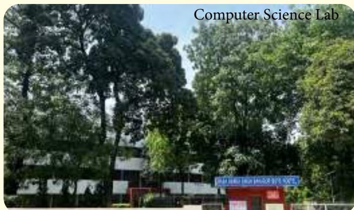
Computer Science Lab