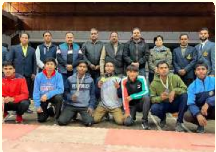
Winners of Panjab University Wushu Championship