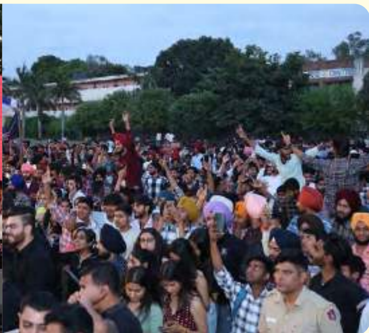
Punjabi Singer Jass Bajwa performing at 'Lishkara 2023'- A Two Day Sports and Cultural Extravaganza