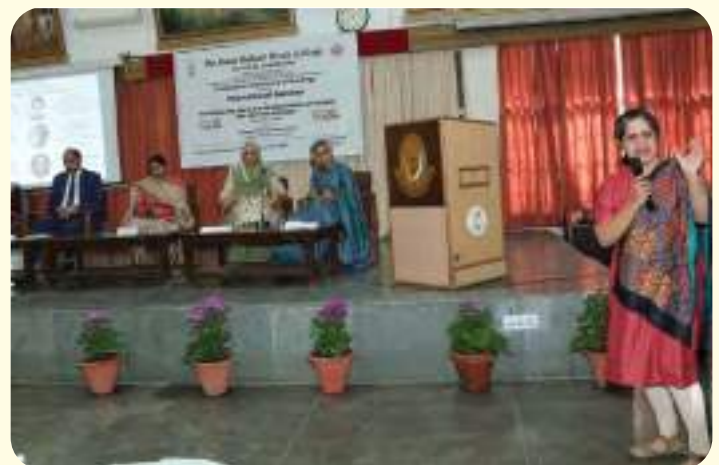
International Seminar on ‘Revisiting the Impact of Modernisation on Gender: The Intricate Linkages’ on Feb 21, 2023.