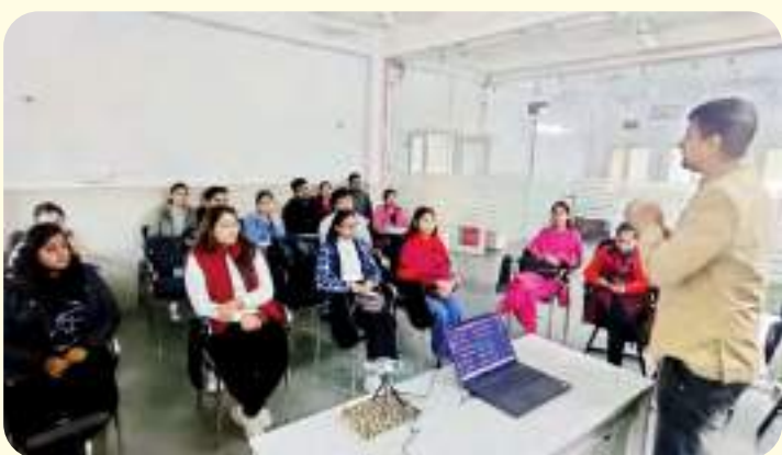
Visit to Pre-Incubation Centre of TBI-IISER, Mohali by IIC of the College