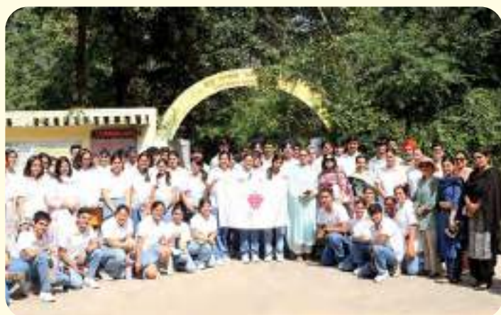
Visit of students from Strawberry Fields-26, Chd to Guru Nanak Sacred Forest commemorating World Earth Day

Sri Guru Gobind Singh College had initiated a novel idea of creating a mini-urban forest on Campus in April 2019 with an objective to promote a sustainable environment. This habitation has now flourished into a natural air-purifying dense forest with 550 trees comprising 49 different native species of the region planted in an area of 180 square metres. With the creation of the mini-urban forest, the College has made a niche in the field of environment sustainability, biodiversity conservation and preservation of genetic heritage. This tiny forest space is acting as a safe refuge for insects, birds and other fauna that are gradually disappearing from the ecosystem and is a major step in reducing the Carbon Footprint of the region. An Observation and Research Centre in the forest area facilitates research by the students and faculty, on the potential of native species for Sustainable Development. Sacred and Healing herbs have been planted in the adjoining area named Balihari Kudrat. Various Campaigns, Workshops, Nature Trails and events promoting awareness