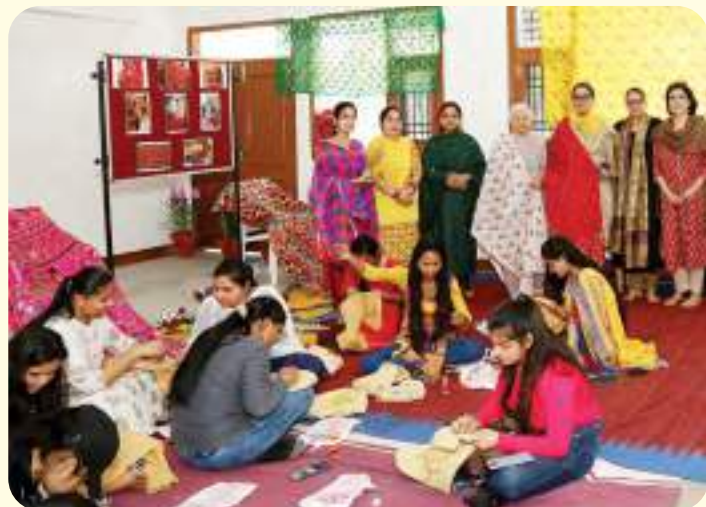
One Day Inter-College Workshop on 'Heritage and Art and Craft Items'

household artifacts. The NAAC Peer Team visited the exhibition and commended the display items along with their historical significance.