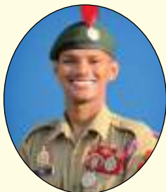
AJIT BA II