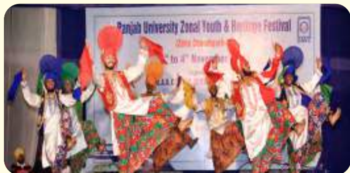
Bhangra - Second in PU Zonal Youth & Heritage Festival 2022-23