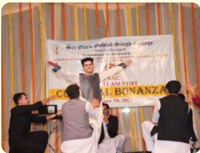
Karsak Dance performance by students of Afganistan