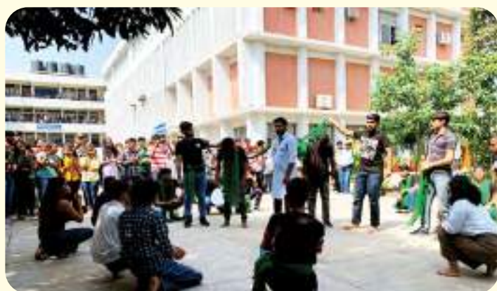
Nukkad Natak 'Inquilab' on the life of Shaheed Bhagat Singh to celebrate 75 years of India's Independence