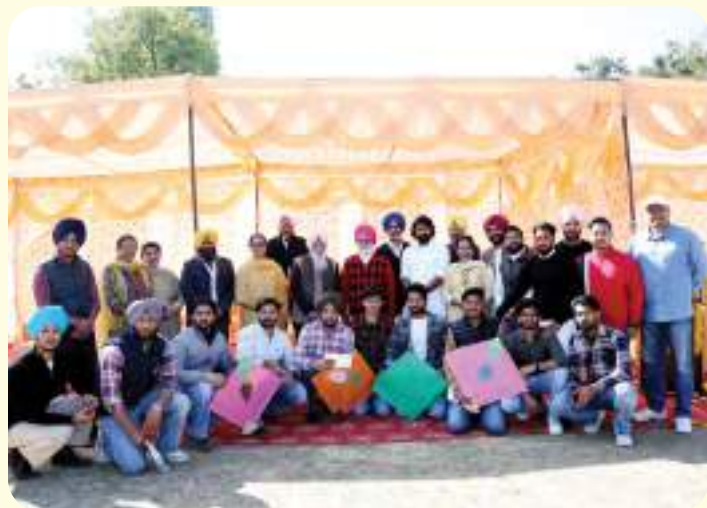
Winners of Inter-College Kite Flying Competition Feb 13, 2023