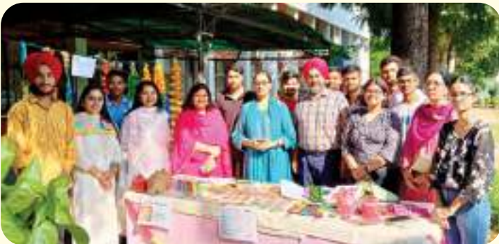
Diwali Sale of Handmade Candles by visually impaired students in collaboration with the Institute for the Blind, Chd