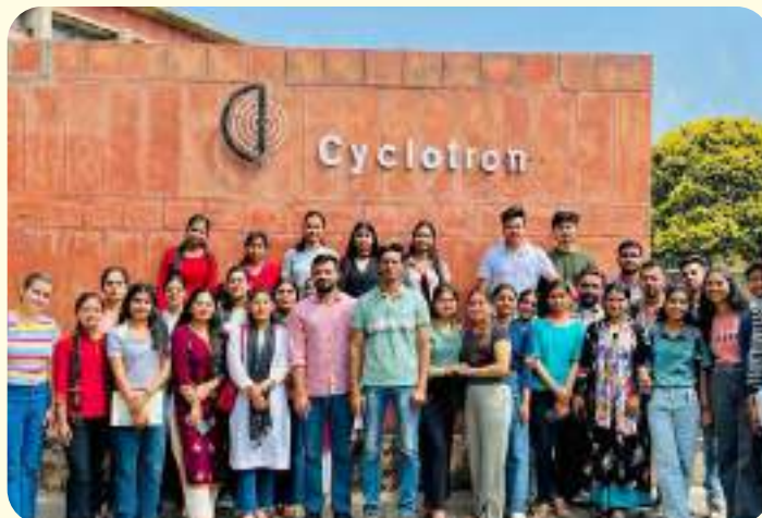
Educational Visit to Variable Energy Cyclotron Centre, PU, Chandigarh on Mar 17, 2023

28 students got the exposure to the field of nuclear science and technology and also got a first-hand experience of the research facilities and projects being undertaken at the VECC. The visit was